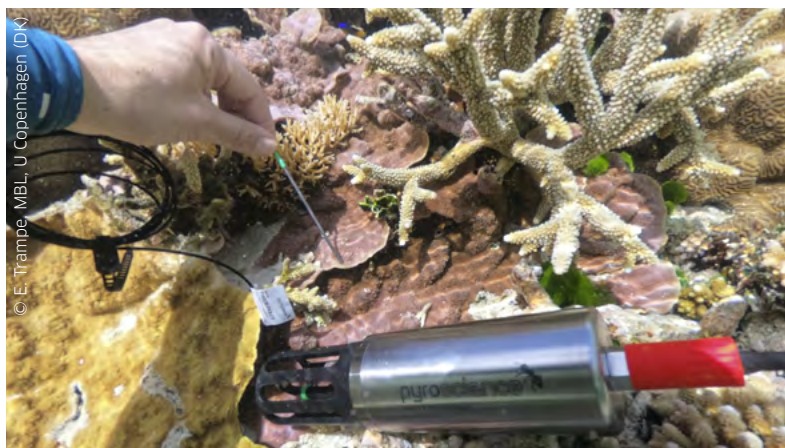
Measurement on the Great Barrier Reef