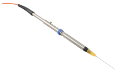
Microsensors (ca. 50-70 µm tip) retractable & fixed needle type sensors