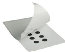
Sensor Spots with contactless read-out through a transparent window (e.g. in incubation chambers)

Ultra-High Speed and Trace O 2 Sensors available