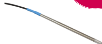
Robust Probes with different tip & cable lengths or as screw cap probe with exchangeable sensor caps

Ultra-High Speed and Trace O 2 Sensors available