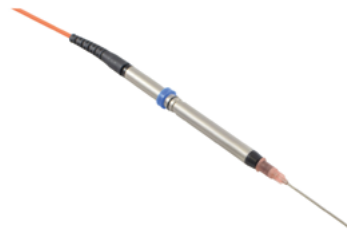
Minisensors (430 µm tip) retractable & fixed needle type sensors