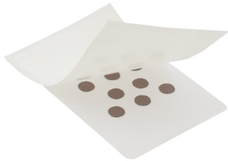
Sensor Spots self-adhesive, sterilized